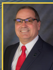
State Senator Dan Dernulc Senate District 1