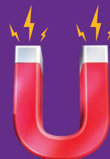
Magnet 1.5 T Strength DeKalb Health High-Field, Large-Opening MRI Magnet Strength

When we say a strong magnet is better for providing the highest-quality MRI possible, we mean it. A look at the graphic below helps explain how.