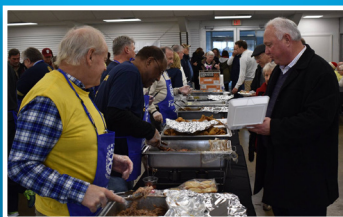
→ Community Service Award – Franklin Rotary Club