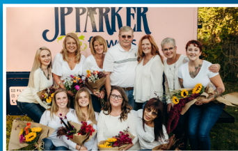
→ Business Hall of Fame Award – JP Parker Flowers