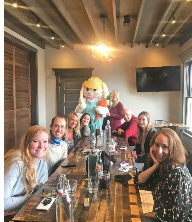
Chamber ambassadors received a surprise visit during their ambassador meeting from Johnson County Senior Services with the reminder that "Some Bunny loves us!" ↑

As I reflect back on where we were a year ago, we know that whatever comes our way, the businesses and residents of Franklin will pull together and our resourcefulness and resiliency will shine through. Our business community never ceases to amaze me by implementing new strategies to keep moving forward. The Franklin Chamber has certainly taken lessons