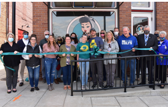
Norma Jean's Pastries celebrated its grand opening with a ribbon cutting. Visit them at 49 N Main Street in Franklin.

and gathered inspiration through connecting with all of you. Remember in the days to come, whatever the future holds, the Franklin Chamber is here for you, your employees and your business and my door is always open.