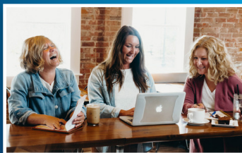
→ Community Impact Award – Main & Madison Market Café

The Franklin Chamber, in partnership with the City of Franklin, presented a virtual video of the Franklin Chamber Annual Meeting featuring Franklin's State of The City Address. The event featured annual Chamber awards recognizing deserving community leaders. View the video on YouTube.