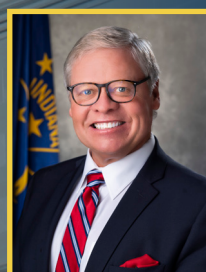
State Senator Ron Alting Senate District 22