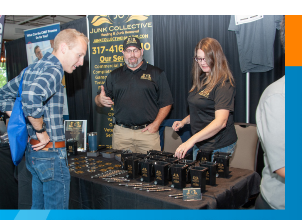
Junk Collective connected with potential customers as an exhibitor at BizBash Business & Community Expo . •

Plans are already underway for next year's event. I hope you will join us for the next BizBash Business & Community Expo scheduled for September 15, 2022!