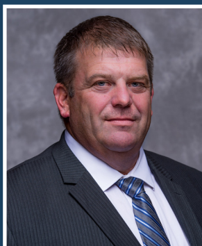
Senate District 12