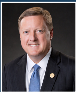
State Senator Eric Koch Senate District 44