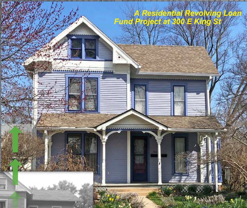
A Residential Revolving Loan Fund Project at 300 E King St