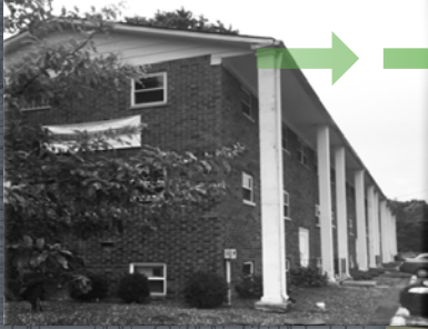
A Commerical Façade Grant and Commerical Revolving Loan Fund Project at 401 N Main St